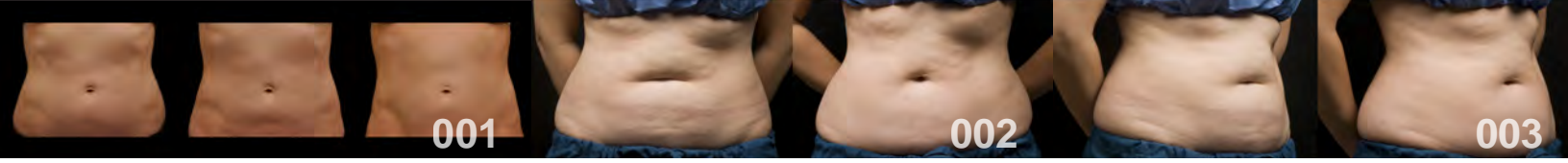
001 Before Procedure by Kathleen Weisk, MD Patient number: WEL 001 5 months after One CoolSculpting procedure 1 month after Two CoolSculpting procedures 002 Before Procedure by Ivan A. Rosales-Berber, MD Patient number: SLP 052 3 months after One CoolSculpting procedure 003 Before Procedure by Ivan A. Rosales-Berber, MD Patient number: SLP 052 3 months after One CoolSculpting procedure