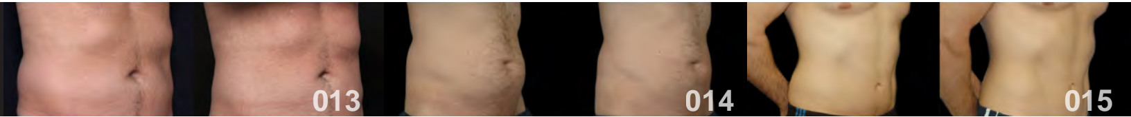
013 Before Procedure by Leyds E. Bowes, MD Patient number: BOW 001 2 months after Two CoolSculpting procedures 014 Before Procedure by Christine Diericks, MD Patient number: DIE 003 2 months after One CoolSculpting procedure 015 Before Procedure by Scott Sattler, MD, FACS Patient number: SAT 001 4 months after Two CoolSculpting procedures